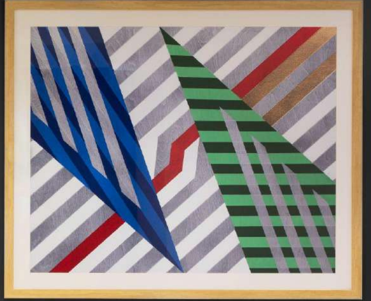
1970s Abstract 1970s Abstract